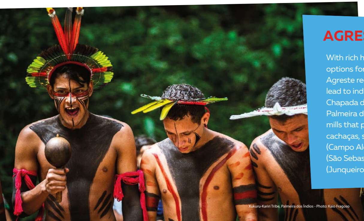
Xukuru-Kariri Tribe, Palmeira dos Índios - Photo: Kalo Fragoso