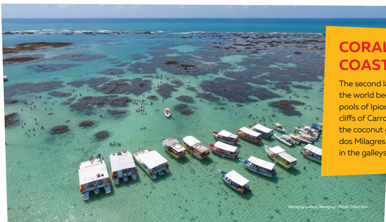
Maragogi galleys, Maragogi

The second largest coral reef in the world begins in the natural pools of Ipioca, gives way to the cliffs of Carro Quebrado, protects the coconut groves of São Miguel dos Milagres and dazzles visitors in the galleys of Maragogi.