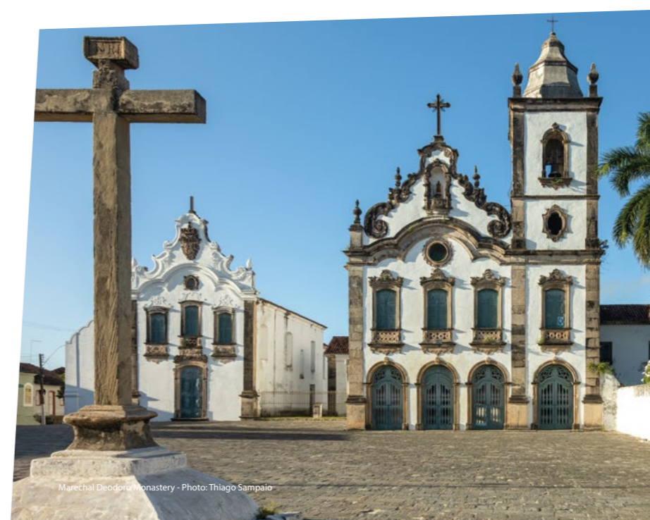
Marechal Deodoro's monastery