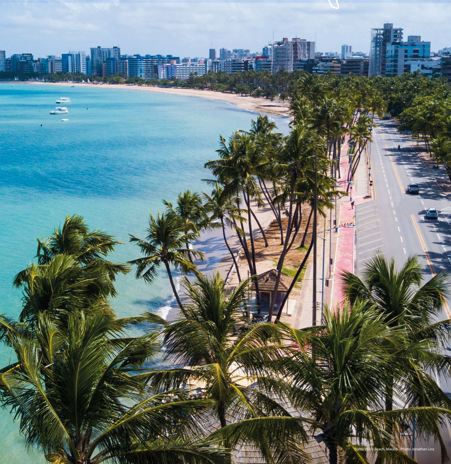
Ponta Verde Beach, Maceió