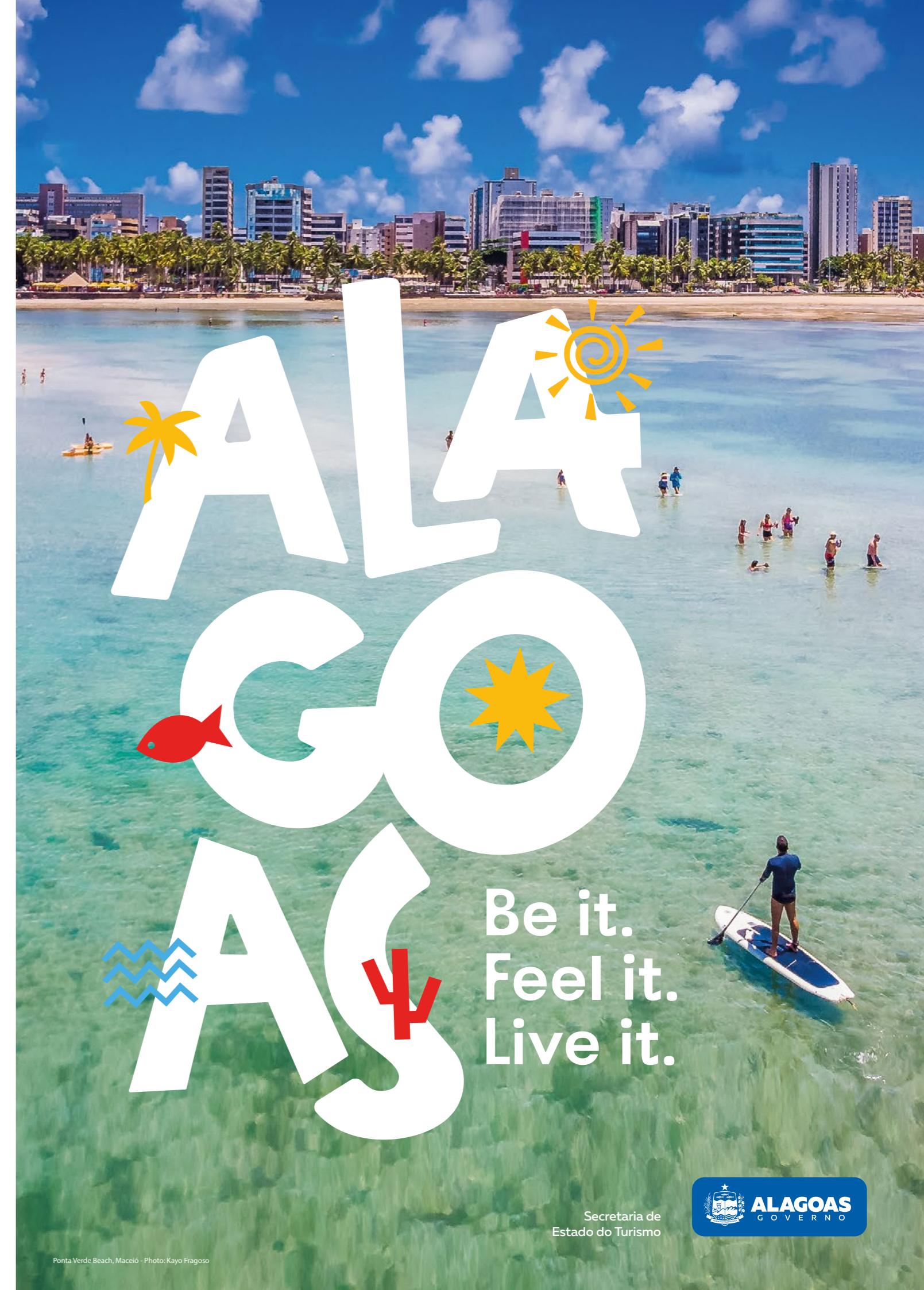
Ponta Verde Beach, Maceió